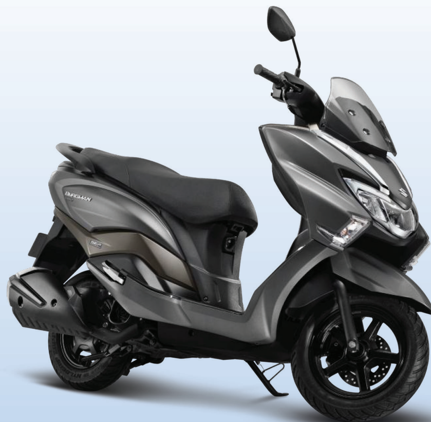
Metallic Matt Fibroin Gray (PGZ)