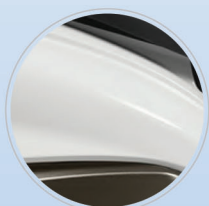
Pearl Mirage White (YPA)